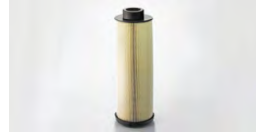
Engine Oil Filter