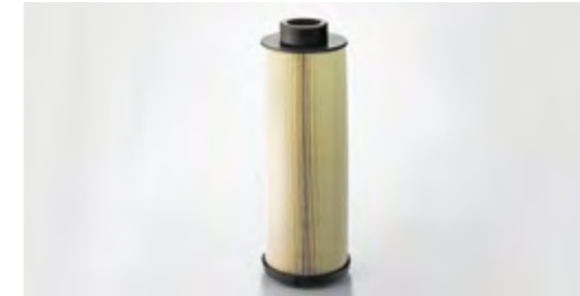
Engine Oil Filter